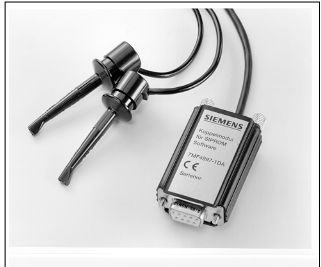
Fig. 1: Interface

The interface was tested on the above mentioned combinations.